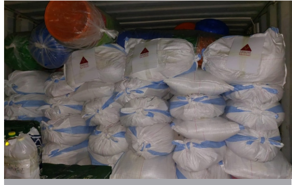
Food parcels for the northern parts of Mozambique

At least 1.5 million people will need life-saving and life-sustaining humanitarian assistance and protection in northern Mozambique in 2022 due to the continued impact of armed conflict, violence and insecurity in Cabo Delgado Province. This includes the 745,000 conflict-displaced people, as well as people in host communities whose coping capacities have been exhausted after three years of opening their homes to those fleeing the violence. Arkhê Risk Solutions also sponsors food parcels to assist in this.