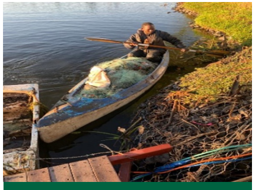
Illegal fisherman caught on the Dam