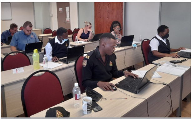
Omega Employees during the Excel training course

OTA has now scheduled MS Office training sessions on a monthly basis and our aim is to get students from all sectors across the country. These courses are fully accredited and internationally recognized and are presented on-line and in-class.